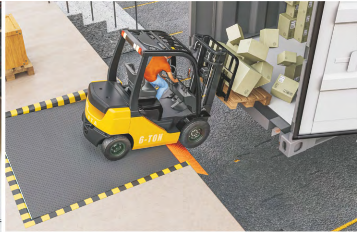
Example of early vehicle departure